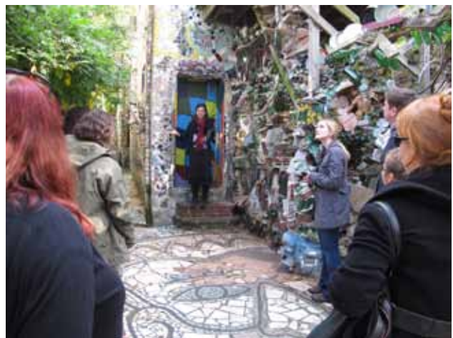
Open Door at Philadelphia Magic Gardens