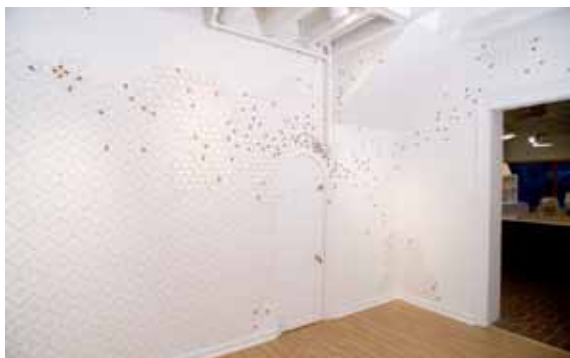
Talia Greene: Cross Pollination , Installation View

Greenburg exhibited a series of manufactured self-portraits, created by replacing individuals in vintage found-negatives with her own image, so constructing an imagined narrative tinged with humor and nostalgia.