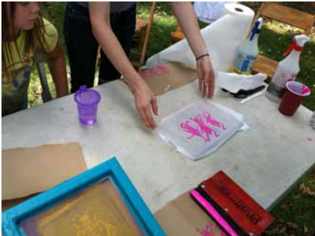
Printing in the Open at Bartram's Garden