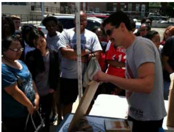
Drive By Press workshop for AISP at South Philadelphia High School

Celebrating its tenth year, the Artists-in-Schools Program (AISP) is The Print Center's award winning education program which brings hands-on learning and self-exploration to Philadelphia's public schools. Year-long residencies supplement and enhance existing art education programs by offering lessons in art appreciation, history and theory in addition to instruction in a variety of print and photo techniques. Since 2002, we are proud to have worked with thousands of underserved inner-city students who reside in some of Philadelphia's most at-risk neighborhoods. In 2003 AISP was recognized by the National Art Education