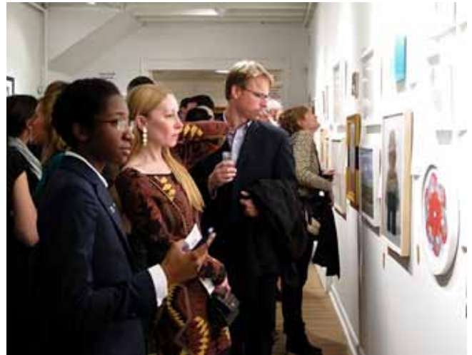
Guests enjoying the Annual Auction