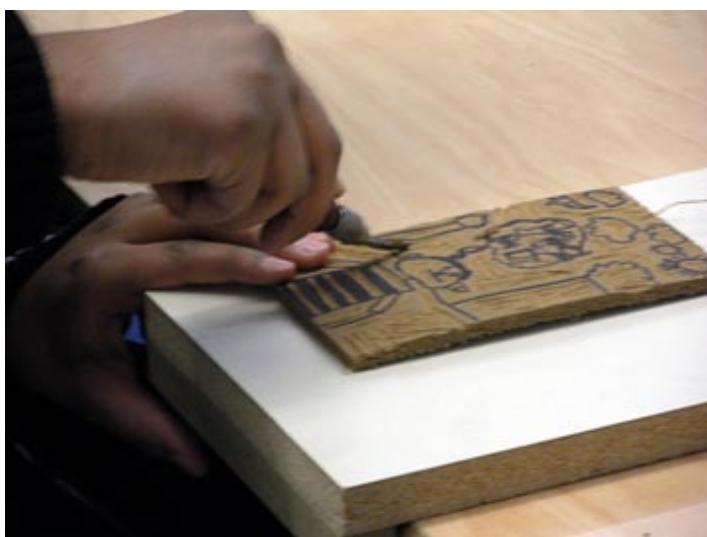
A student at Mastery Charter School carves a linoleum block

Artists-in-Schools Program (AISP) offers hands-on learning and self-exploration to inner-city high school students in Philadelphia's public schools, encouraging them to look beyond the restrictions and limitations of their neighborhoods, to develop an understanding of and appreciation for the visual arts, and to express their own creativity. The program provides artist-educators, course materials and field trips to schools selected on the basis of need which are then served for two years. AISP has a documented record of success and, in 2003, was recognized by the National Art Education Association as a national model for contemporary public arts education. In the 2008–2009 school year, we inaugurated a short format program designed to supplement our existing two-semester program, and served approximately 500 students at Martin Luther King, Mastery Charter School, Northeast, Olney, Parkway High School for Peace, South Philadelphia and University City High Schools.