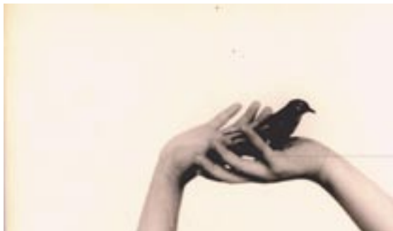
Masao Yamamoto, Untitled #955 , Gelatin silver print with mixed media

It is a great pleasure to report on a wonderful year of excellent and exciting programs and accomplishments for The Print Center. In addition to presenting a full schedule of exhibitions and educational programs, we were busily engaged in growing the reputation and profile of The Print Center while participating in our community. I am especially pleased by the attention we have received from national level foundations. We were awarded a large grant from The Andy Warhol Foundation for the Visual Arts for two years of general program support, as well as support from the International Fine Print Dealers Association for our exhibition Pulling From History: The Old Masters and from the Japan Foundation for Nakazora: space between sky and earth: Masao Yamamoto . These grants not only provide financial awards, but also validate the relevance and significance of the quality of the work we present. We look forward to offering more high quality and exciting programs.