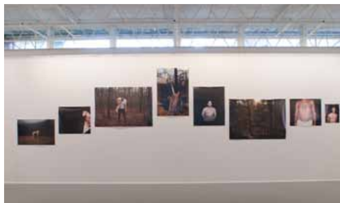
Installation view, Sweet Meat