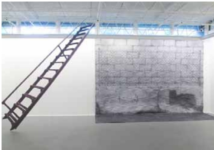
Installation View, To Scale