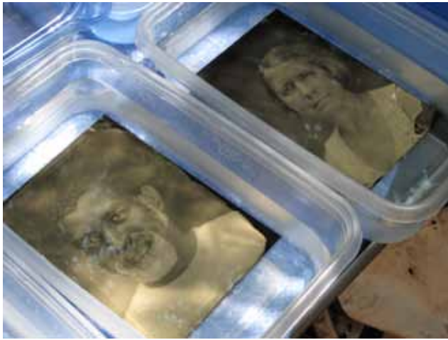
Tintypes developing in our garden