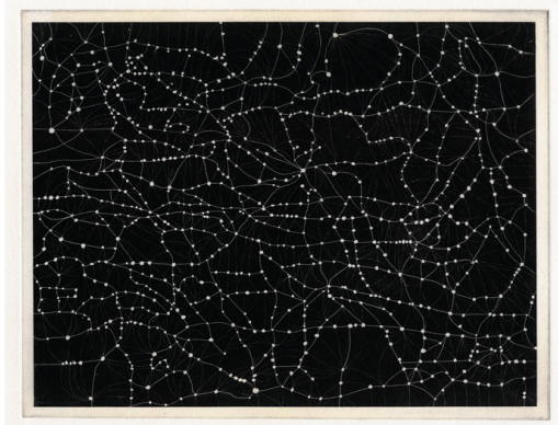
Iowa, 2010 Photopolymer intaglio 15" x 18 1/2" Edition 2 of 10