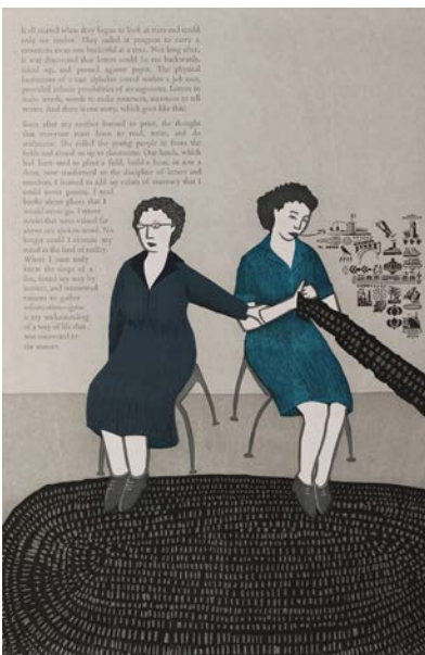
Progress, 2012 Woodblock, letterpress Plate Size: 17” x 11” Paper Size: 22” x 15” Edition: 5