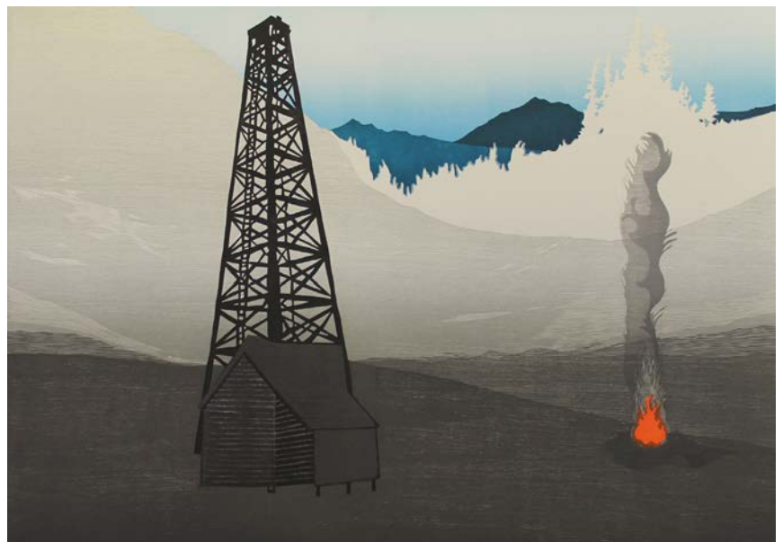
February, 2012 Woodblock Image size: 16” x 24” Paper size: 17” x 25” Edition: 5