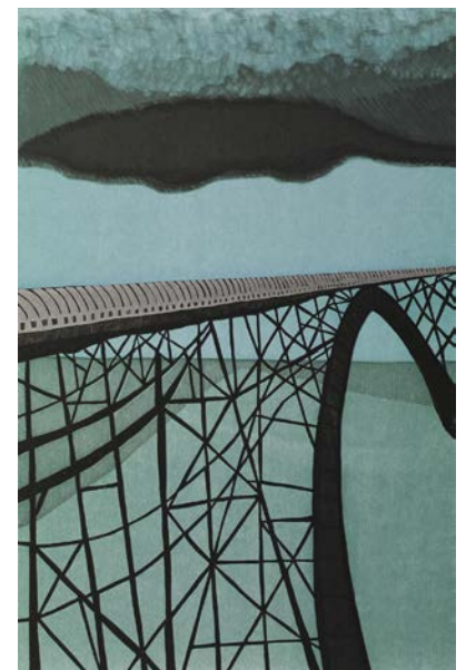
The Distance Between Two Things , 2012, Woodblock Plate Size: 17" x 11" Edition: 5

Many years later, the interest in words persists, particularly letterpress printed words. Learning to cast type over the past two years has broadened my interest in text. While in many ways, casting type is a technical skill, the experience has given me a greater understanding of the physicality of language, type as object, and the history of the printed word. The most basic notion of text is as a place for narrative to begin. This is demonstrated in the print Specimen of Bembo , for which I cast the type face Bembo in 16 point size, filling an entire case. Then I set each letter I cast into the bed of the press, printing every single cast object. The physical limitations of a job case, filled with type offers infinite possibilities of arrangements for letters to make words, words to make sentences, and sentences to tell stories.